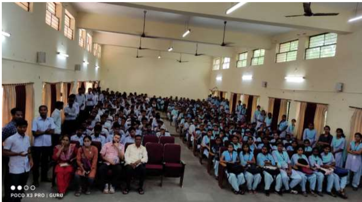
A large number of students and faculty members of Karnatak Science College, Dharwad attended the “Save Soil” programme at the BCA Auditorium in KCD campus.