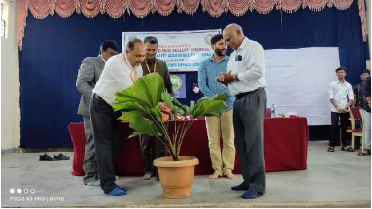
Inauguration of the "Save Soil" program.