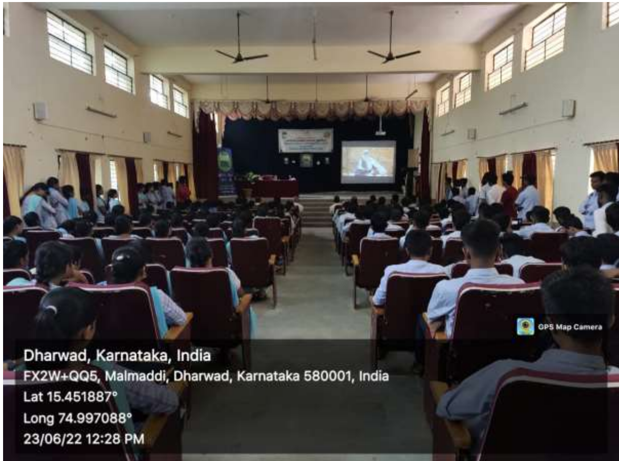
A view of the BCA auditorium during the conduct of the “Save Soil” programme at K.Sc.C.D