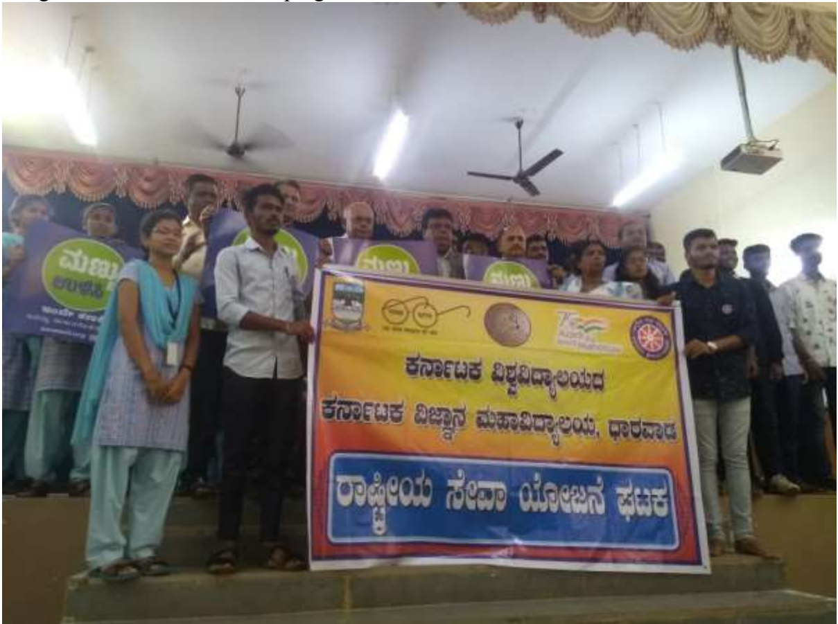
The "Save Soil" program was held under the banner of the NSS wing of Karnatak Science College, Dharwad.